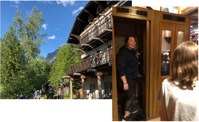
Lake McDonald ... and the kids discovering a phone both for the first time ☺