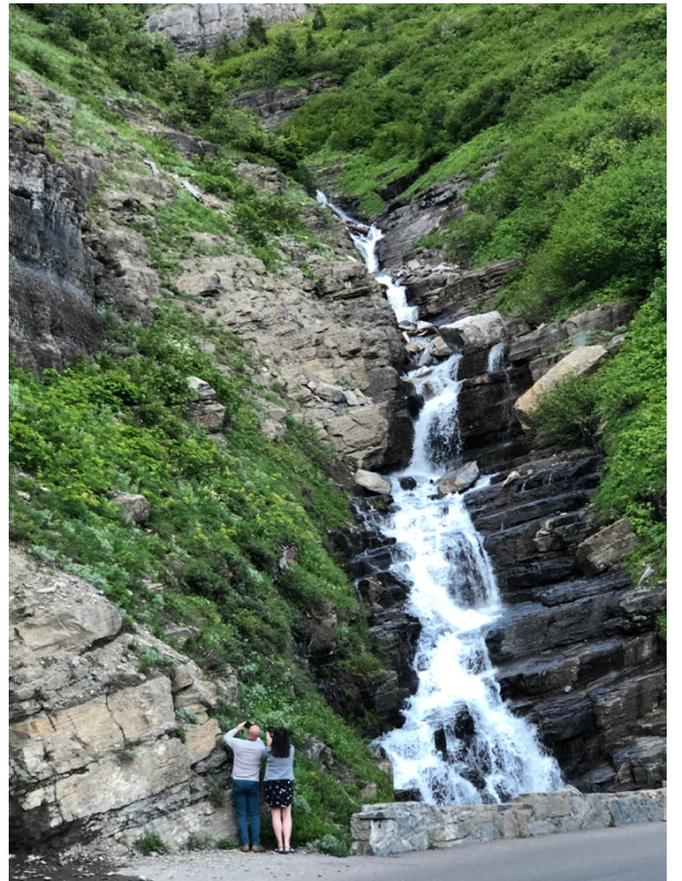
Glacier National Park