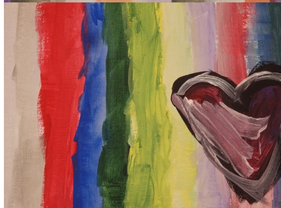
Previous Page and Top Photos – Cabin Costume Party Rest of This Page – Paintings by campers as part of Canvas Paining elective